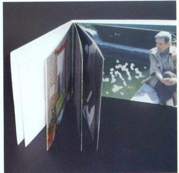
مكتوب بالمياه - ٢٠٠٥ ميريللا بنتيفوليو - إيطاليا writ in Water - 2005 Mirella Bentivoglio - Italy