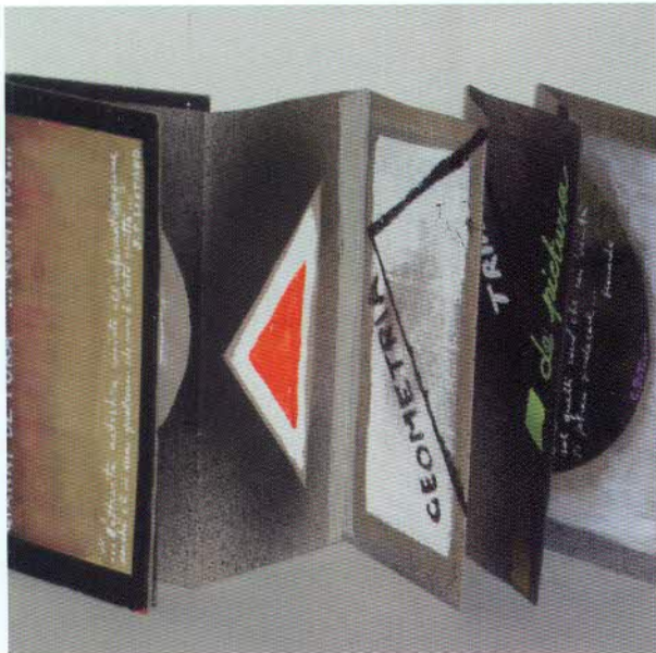
الرسول - ١٩٩٨ جياني دي تورا - إيطاليا ..Nuntius.. - 1990 Gianni De Tora - Italy